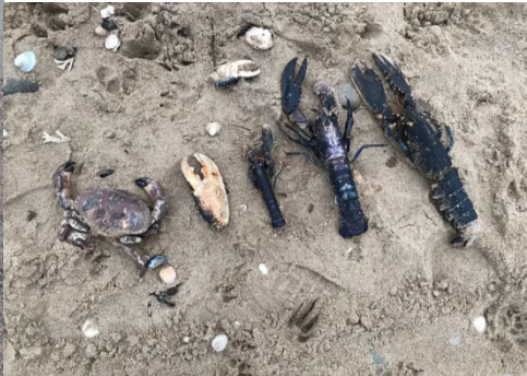
Mass Shellfish/Razor Clams